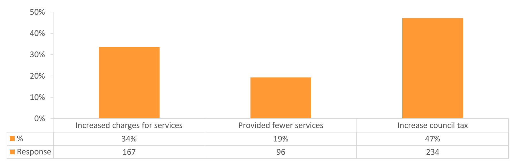
Council Tax In order to balance the budget, would you rather we; (please tick as many as apply)